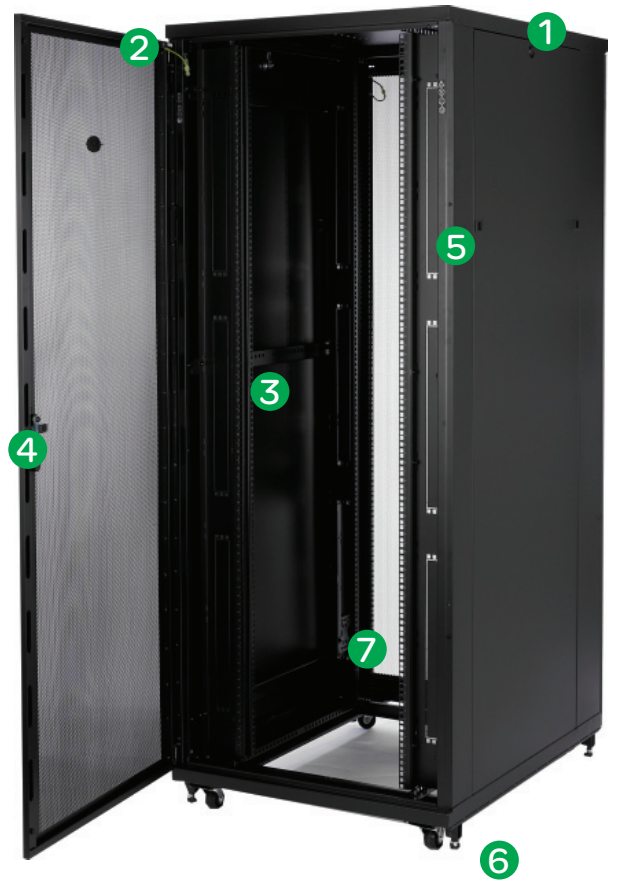
AR2480 shown - 42U x 800 mm width x 1,060 mm depth