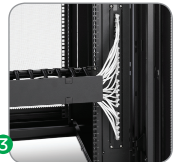
600 mm width