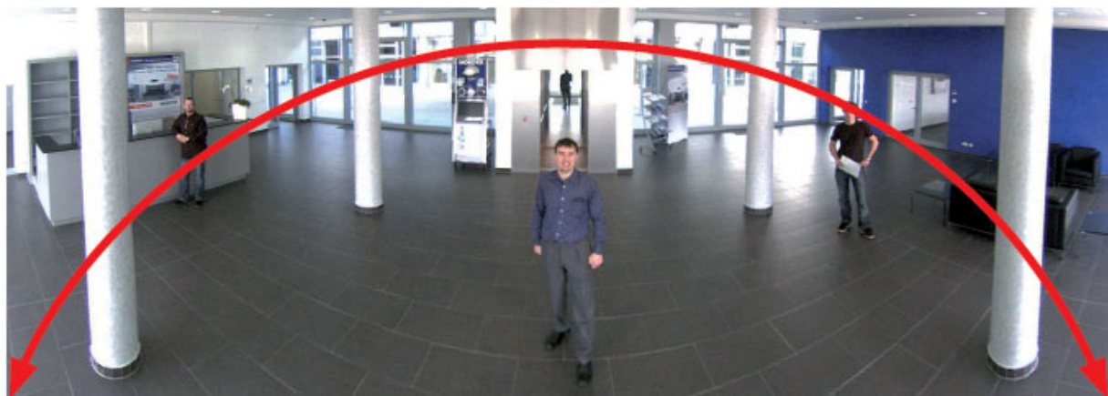
Wall-mounted i25 captures 180° field of view – no blind spots.