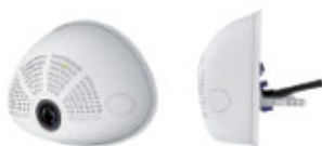
Lens tilted down 15 deg.